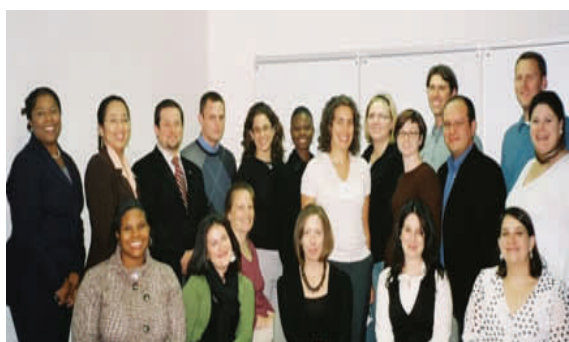
DC-EPFP Class of 2009